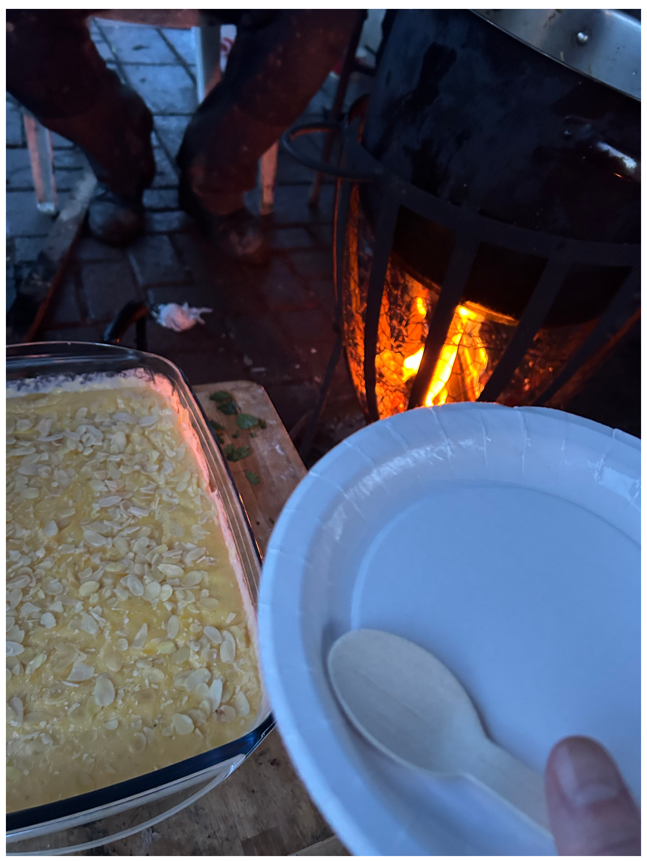
Thank you so much! Imagine what might have happen during the night if I never got any food or friendly love. i believe you saved my life yesterday.